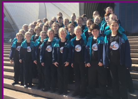
Bel Canto at their recent Sydney Opera House performance